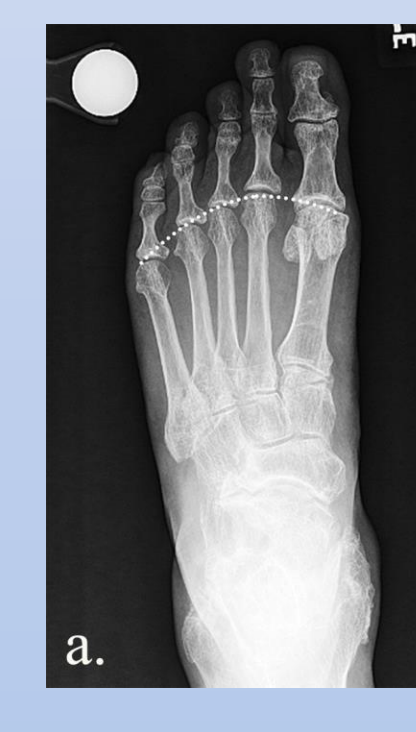
Figure 1: Anteroposterior (AP) radiograph of the foot. The dotted lines demonstrate the metatarsal head parabola in a. normal foot and b. disruption of this parabolic arc in a patient with first and fourth brachymetatarsia. The yellow lines represent the distance required to achieve an ideal parabola by distraction osteogenesis. c. Clinical photograph of the foot of the patient in a standing position demonstrating the first and fourth brachymetatarsia.