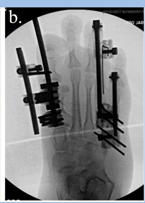
Figure 2: Intraoperative a. clinical photograph and b. fluoroscopic image of the mini-external fixators after application to the affected first and fourth metatarsal in the same patient. The first MTP has been spanned with an additional external fixator to distract the joint. The 4th MTP has been pinned with a K-wire attached to an additional external fixator as well.