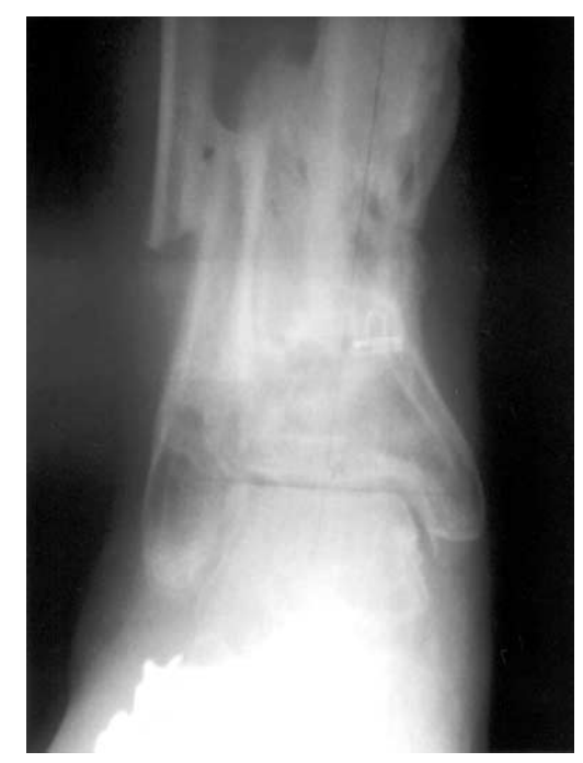
Figure 5. AP radiograph of distal tibia and fibula after union

With comminuted, open fractures of the distal third of the tibia open reduction internal fixation and intramedullary nailing may have a limited role. Bone grafting may used to fill bony defects but it has its own associated morbidity [18]. With these fractures, Ilizarov external fixation may be used to achieve fracture union as well as wound closure. New methods employing the Ilizarov technique may provide distinct advantages regarding the soft tissues. These advantages may include fewer indications for rotational and free flap wound coverage, less need for amputation, fewer infections, and shorter treatment time. In addition the surgery is performed using percutaneous technique with limited exposure to minimize soft tissue trauma. Postoperatively the frame allows adjustability as well early weight bearing through axially dynamized stable fixation [19].