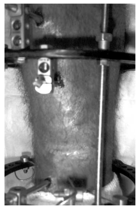
Figure 4. Leg wound two months after Ilizarov frame application

after these fractures [1,2,3,4,5]. Treatment options may be limited, especially with fractures of the distal third of the tibia. In this region, distally based muscle flaps and fasciocutaneous flaps have been used with varying amounts of success [16,17]. The primary option for coverage of the distal third of the tibia is a free flap. When a free flap is not possible or has failed, a cross-leg flap remains a useful option despite its significant morbidity.