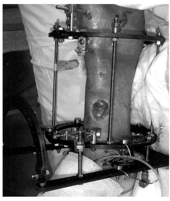
Figure 2. Leg wound at the time of Ilizarov frame application

numbness. Angiography was done and showed disruption of the anterior tibial artery at the level of the tibial shaft fracture. Other than a scalp laceration the remainder of the trauma work-up was negative.