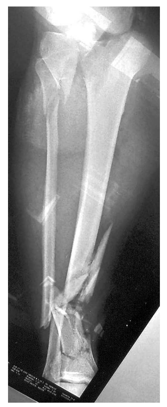
Figure 1. Injury anteroposterior (AP) radiograph of tibia and fibula

Recently, the Ilizarov technique has been used to close chronic soft tissue defects of the tibia. Soft tissue has been transported along with bone to close large defects [12]. Skin traction employing hooks and an Ilizarov frame has also been used with success to close tibial wounds [13]. This case report will discuss the closure of a 4 \times 4.5 centimeter (cm) distal leg wound over the subcutaneous surface of the tibia that resulted from an open grade IIIB tibia fracture [14]. The wound was closed with an Ilizarov frame utilizing gradual compression across the segmental fracture site and wound. This technique using closure, rather than coverage, may provide an answer for difficult tibia wounds.