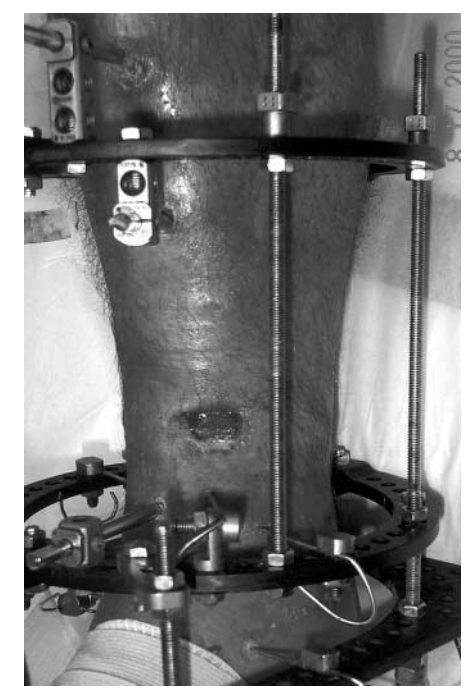
Figure 3. Leg wound one month after Ilizarov frame application

The patient was brought back to the operating room and his right tibia wound was once again debrided. All loose, exposed, and desiccated bone was removed