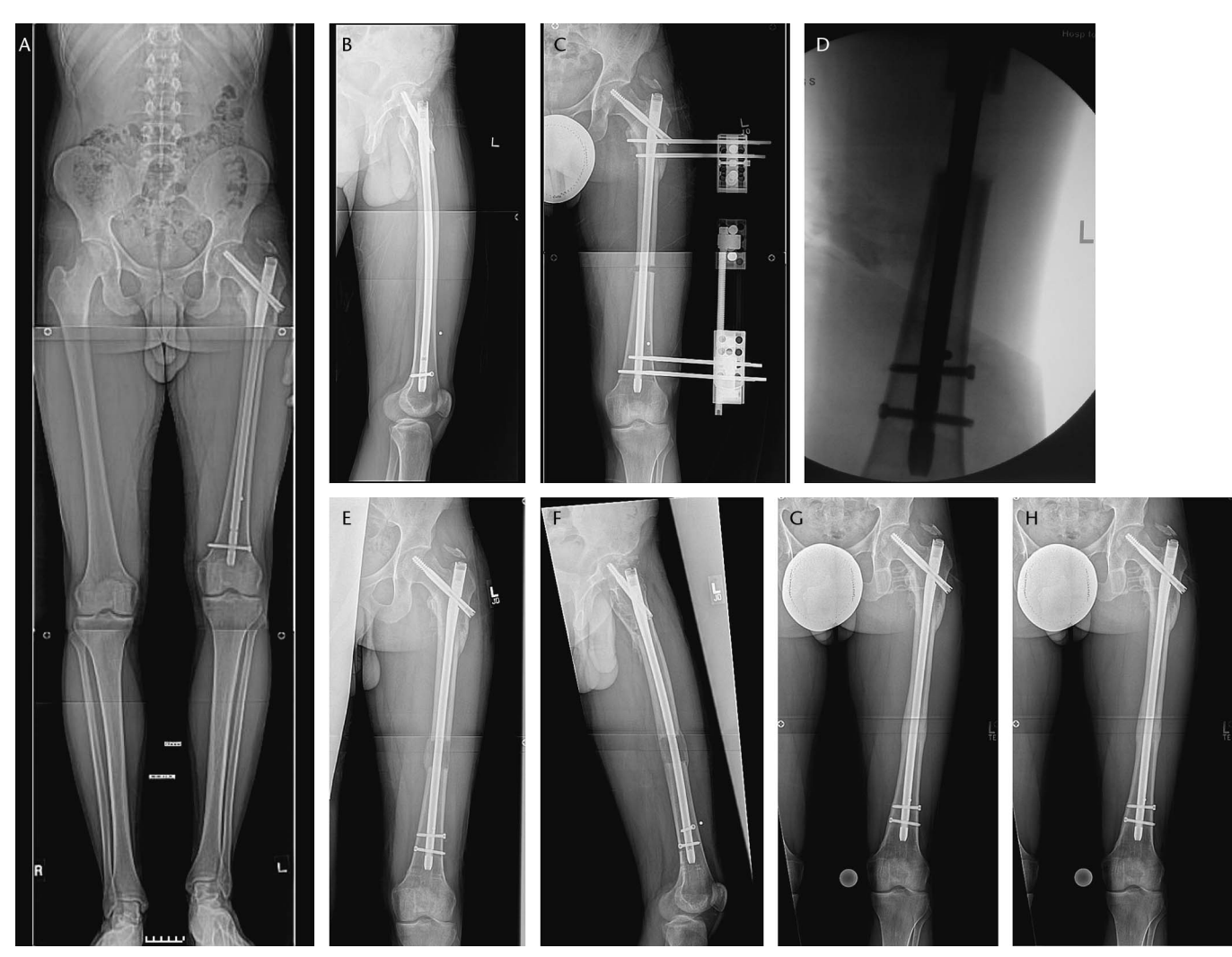
FIGURE 1. (A) A 25-year-old man with 3-cm shortening after intramedullary (IM) nailing of a femur fracture. (C) Anteroposterior (AP) x-ray 2 weeks after surgery showing early distraction around the IM nail. The rail external fixator is parallel to the IM nail. (D) Intraoperative x-ray after completion of the 3-cm lengthening and insertion of locking screws and removal of the external fixator. (E–F) AP and lateral x-rays 1 month after insertion of interlocking screws. Note progression of bony union. (G–H) AP and lateral x-rays 10 months after insertion of interlocking screws. Note complete bony union.

We usually use two 6-mm hydroxyapatite-coated half pins in both the proximal and distal segments.